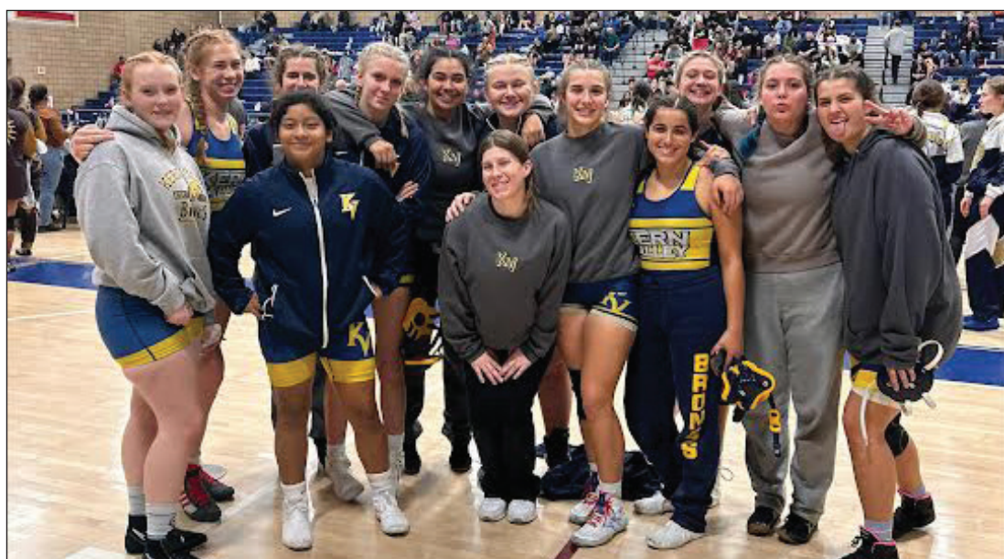
The Lady Broncs that competed at the Queen of the Valley wrestling tournament.

The Lady Broncs will make the long trip to Farmersville as they will participate in the Farmersville Tournament on Saturday.