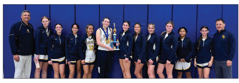
Kern Valley's varsity basketball team along with their coaches pose with the second place trophy they won at the Corcoran Tournament.